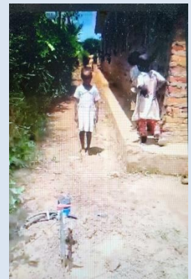
Water being brought to the school