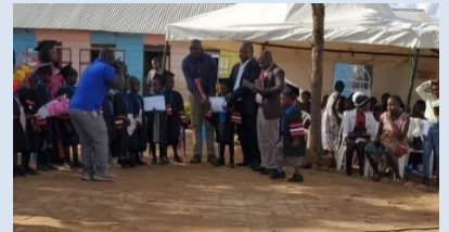
Diplomas handed out to kindergartners